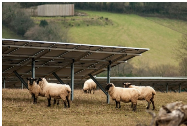
Sheep on site at a solar farm

The Issues Paper highlights that 65% of farms in Galway are involved in beef production. This is not compatible with the recent report by the Intergovernmental Panel on Climate Change (IPCC) stating that global beef consumption must reduce dramatically to avert a climate crisis. Diversifying into solar farms could allow a significant number of Galway farms involved in beef production to transition to sheep grazing and alternative forms of farming while still protecting their livelihoods.